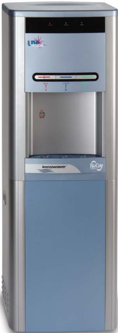
The innowave Chiller GF™ with UV, enhanced with BioCote® technology.